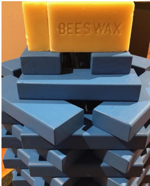
Figure 1: Sculptural representation of the Murray