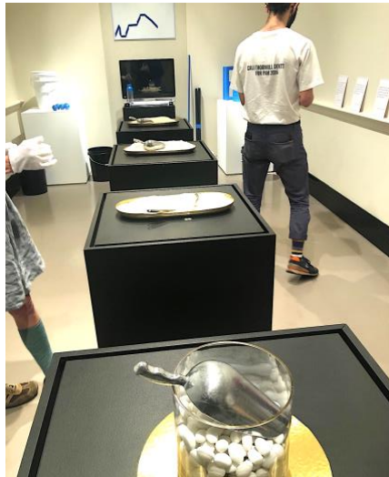
Figure 2: Role Play introductory space

Through action-based instructions, participants became actors in a complex network assemblage of materiality, time, technology and space. We were invited to perform these