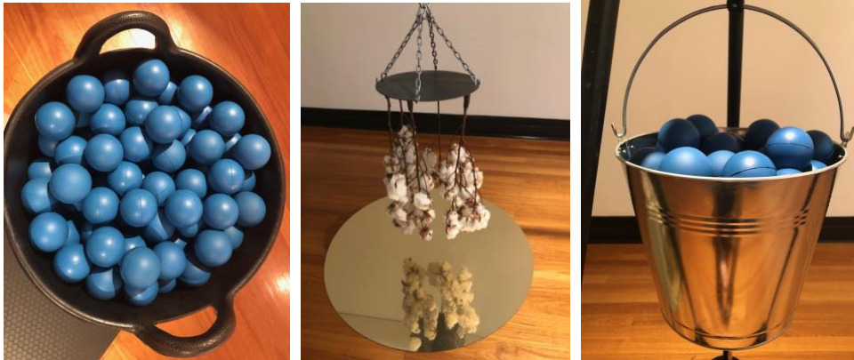
Figure 6: Precarious Balancing Act of Cotton and Water

embodied. A gathering of contradictions, conflated by power, economics and social constructs—political issues that privilege humanity over environmental systems.