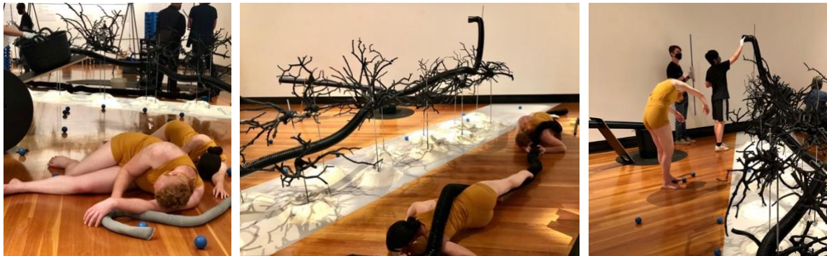
Figure 4: Swimming in and through the Darling River

The disruption in theWay~theWater~theWalk which I mentioned earlier is in relation to the management systems that are impacting the natural waterway environment of the Murray Darling Basin. The blue of water connects us to geolocation—spheres for the Darling River and blocks for the Murray. The silent struggles of the performative fish physicalise an affective haunting via what could be called Process Art, 4 involving choice-driven movement actions in tandem. Astonishing performances by Briega Young and Josian Lulham actualise a kind of speculative fabulation, 5 a situation that these wirrap 6 may very well experience in the Murray Darling Basin.